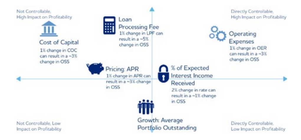
Chart analyzing drivers for profitability in WASH microfinance

The study conducted sensitivity analyses of six potential drivers for WASH loan portfolio viability and gathered input from partners concerning qualitative, non-financial motivations for developing and scaling WASH loan portfolios. The analysis illuminated the following key findings: operational expenses stand out as the single most critical factor impacting profitability; an MFI's cost of capital and operating margins are factors that can significantly impact the long-term profitability of their WASH loan portfolios; and WASH loan portfolio growth alone does not lead to profitability. Based on these findings, we saw both a need and opportunity to support the longterm growth of partners' WASH loan portfolios by providing lower cost capital, drawing on the social capital markets. Additionally, the research indicated that Water.org could play a more active role in creating an enabling environment for WASH microfinance in India by seeking changes in the regulatory policies. Specific policies include those regulated by the Reserve Bank of India, notably the Priority Sector Lending policy as well as income-generating loan portfolio restrictions in microfinance.