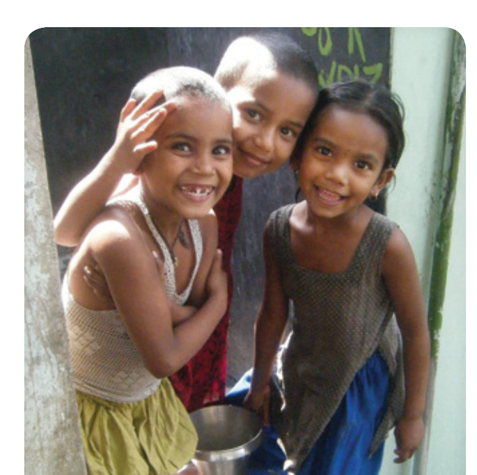
Children fill their jug at a new, clean water tap in Dhaka, Bangladesh

Communities: 264 63.572 Beneficiaries: Active Programs: